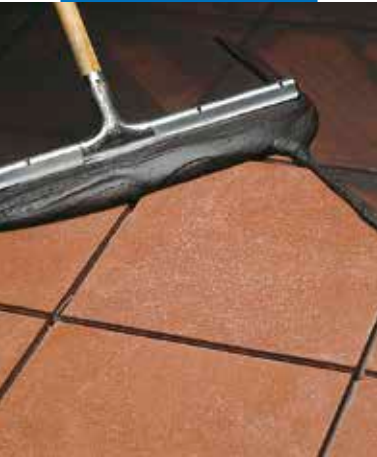
Grouting a terracotta tile floor with float