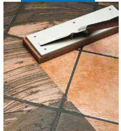
Cleaning a single-fired tile floor with a sponge brush