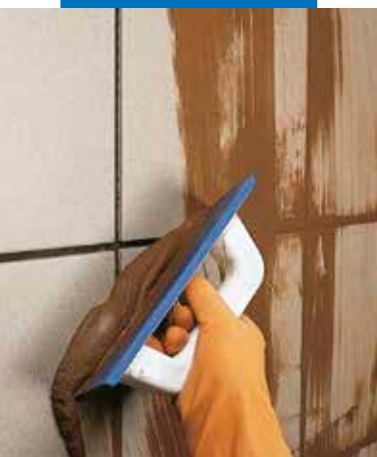
Grouting an external wall with a float