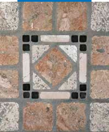
An example of a grouted antiqued marble stone floor

Mapei Australia Pty. Ltd 180 Viking Drive Wacol Qld 4076 Tel. +61-7-3276 5000 - Fax. +61-7-3276 5076 Website: www.mapei.com.au - Email: sales@mapei.com.au