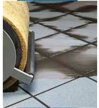
Floor finishing with a machine