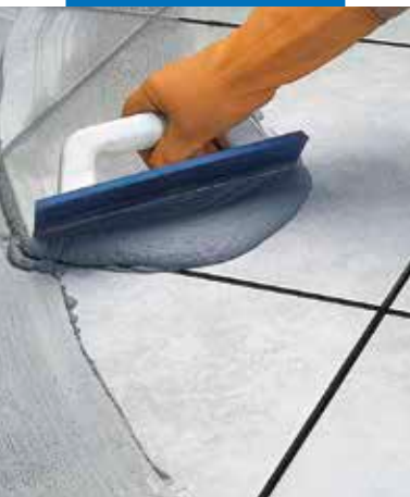
Grouting a ceramic tile floor with a sponge trowel