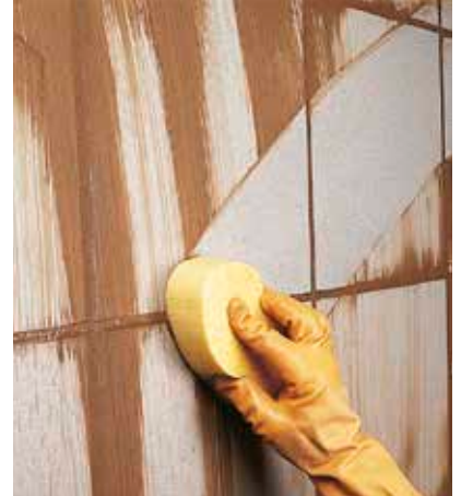
Wall finishing with a sponge

All relevant references for the product are available upon request and from www.mapei.com.au