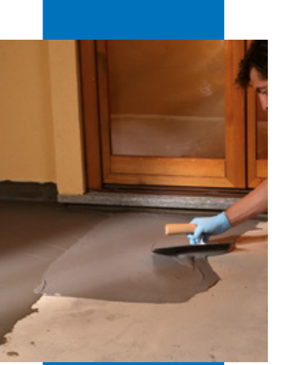
Waterproofing of terraces by trowel

brush, by roller or by spraying with a worm screw rendering machine on both horizontal and vertical surfaces at a thickness of approximately 2 mm. Due to the content and high quality of the synthetic resins, the hardened layer of Mapelastic Smart remains constantly flexible under all environmental conditions.