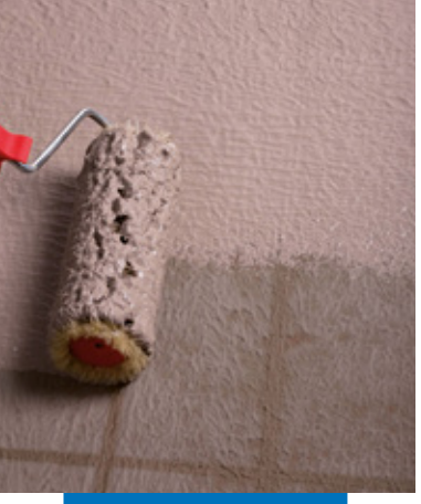
Waterproofing of details by roller