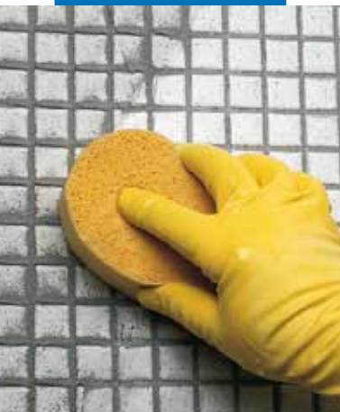
Finishing a glass mosaic with a sponge