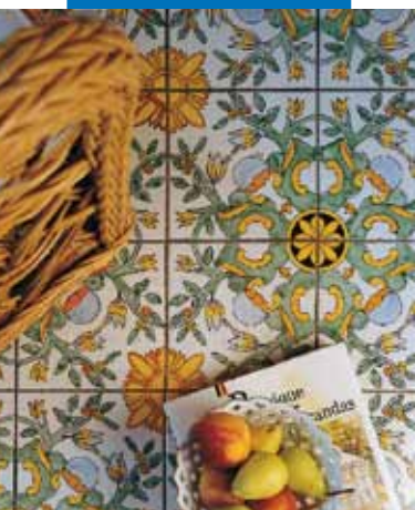
An example of a grouted double-fired tile floor

All relevant references for the product are available upon request and from www.mapei.com