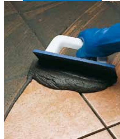
Grouting single-fired tiles with a float