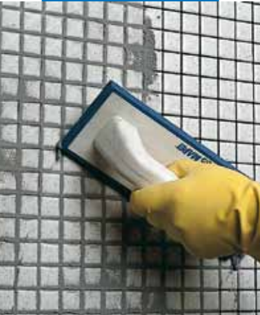
Grouting a glass mosaic (bathroom) with a float