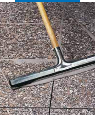
Grouting of pre-smoothed and glossed granite floor with rubber float

not fully hydrated grouts, in substrates not adequately dried, or in substrates not adequately protected from rising damp.