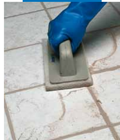
Finishing with a Scotch-Brite® pad