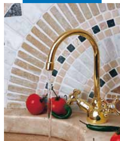
An example of a grouted mosaic tile kitchen