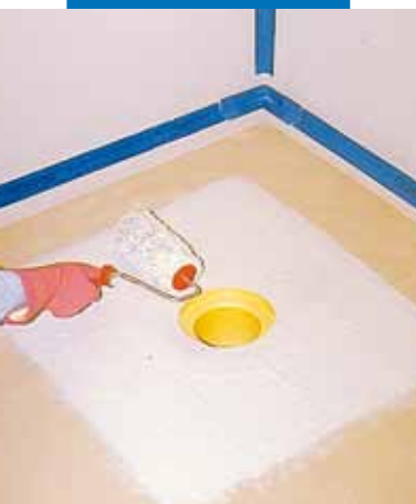
Spreading Mapegum WPS around the drain in a shower cubicle