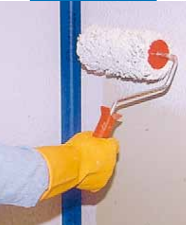
Applying Mapegum WPS on a wall with a roller