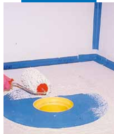
The special piece of Mapeband embedded in the Mapegum WPS