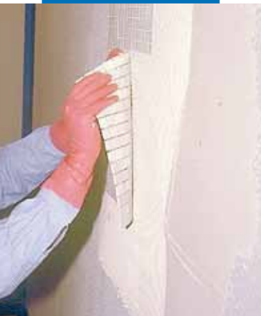
Laying glass mosaic