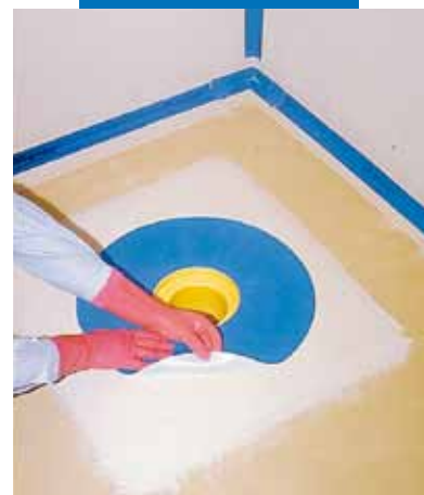
Positioning the special piece of Mapeband over Mapegum WPS

Mapegum WPS is available in 5, 10 and 25 kg drums.