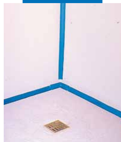
End result of a waterproofing treatment using Mapegum WPS and Mapeband