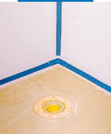
Bathroom wall waterproofed with Mapegum WPS and Mapeband